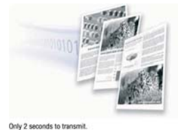
Only 2 seconds to transmit.

It takes only one second to scan a fax message, and only two seconds to transmit it. Fax messages can be forwarded to e-mail and to folder. LAN-faxing (directly from PC) and Internet faxing are possible.