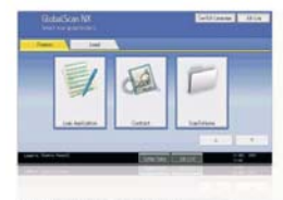
Easy-to-use Graphical User Interface.