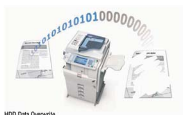
HDD Data Overwrite.

Authentication and encryption features protect your confidential data. The MP C2051/MP C2551 are supplied standard with security packages like HDD Data Overwrite and HDD Encryption.