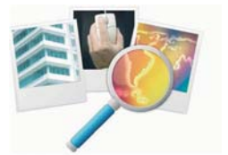
Crisp and accurate colour output.